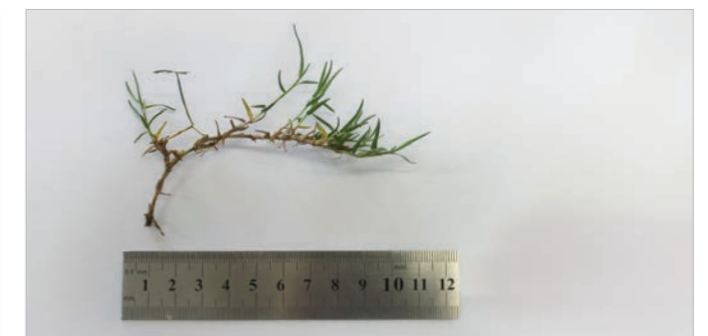
Close-up of live stolon.