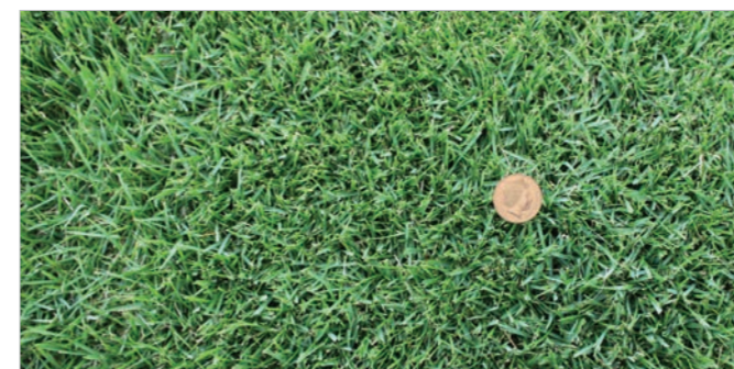
$2 coin on wide shot of grassed area.