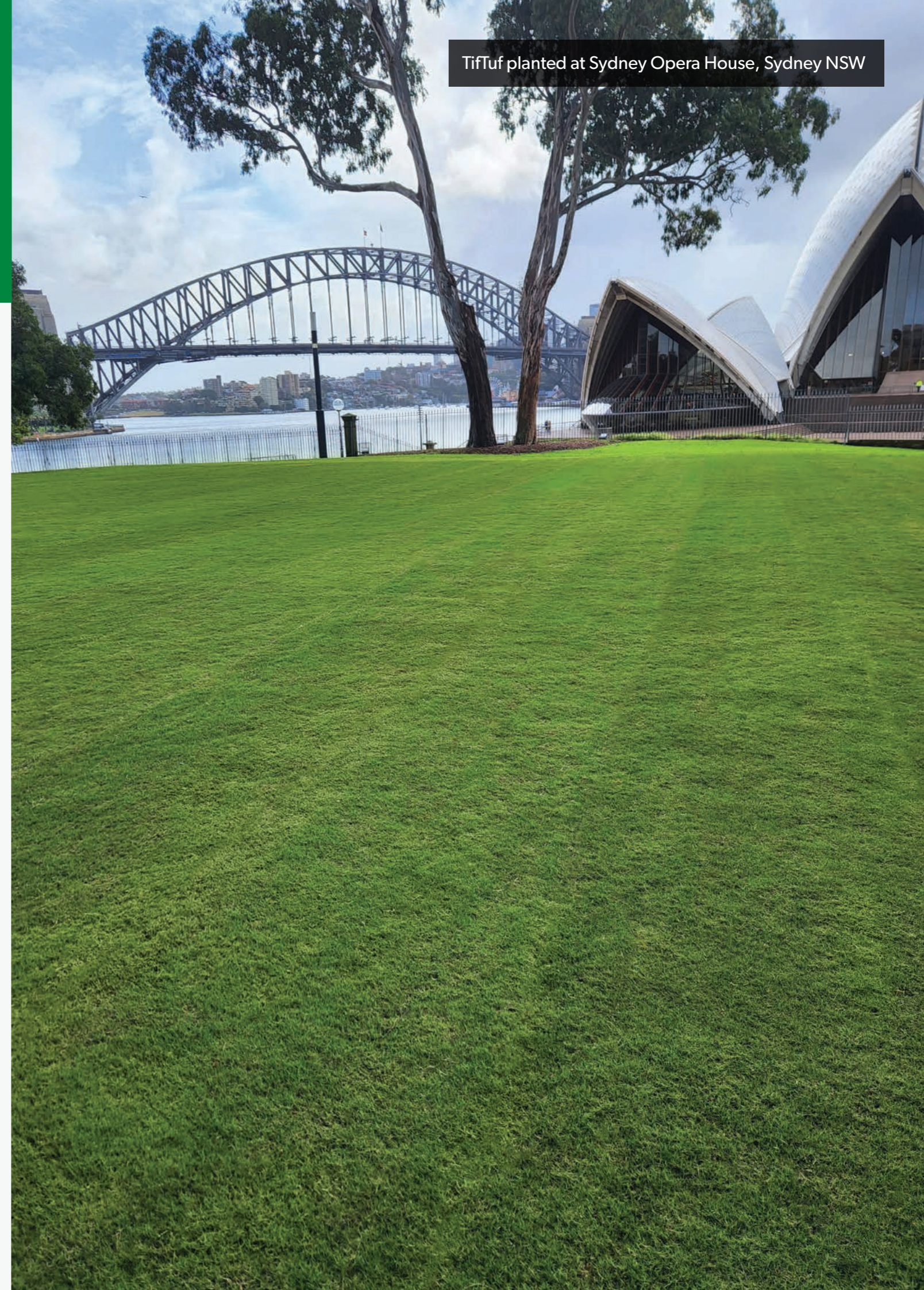
TifTuf planted at Sydney Opera House, Sydney NSW

This was not a surprise to those who have been studying this grass for the best part of three decades. TifTuf has been trialled in the National Turf Evaluation Program (NTEP) in the US, where TifTuf was in the top 25% performing couch grasses for overall quality over 90% of the time.